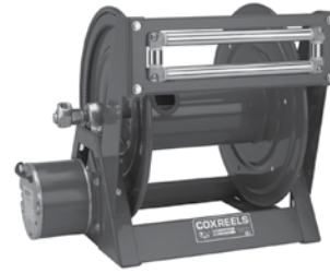
1125 Series, Motor Driven With Optional Roller Hose Guide Sold Separately